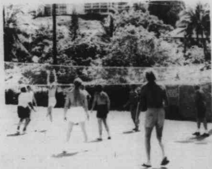
There were many aching backs as a result of this strenuous game of volleyball.