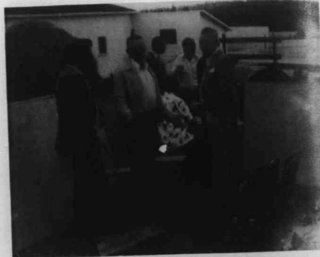
Highlight of Club 183's Summer Bash was the barbecued salmon. Six 12-pounders can be seen in the foreground.