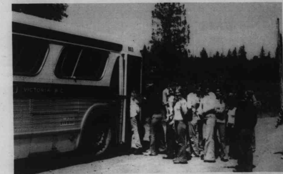
This is one of the two buses used for the Woodlands Tour. The tour takes from 9:00 AM to 5:00 PM.