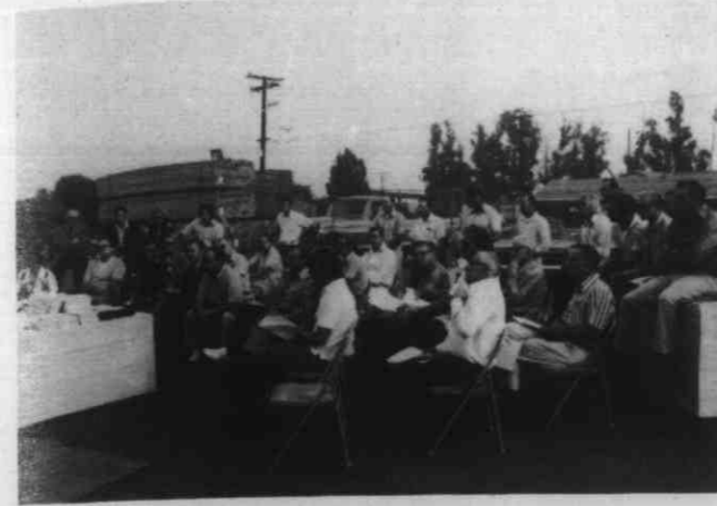
Here's a small portion of the group of 182 people who registered for the Inland Empire Club's Plywood Grading Seminar.

Inland Empire #117 would like to thank all those who participated and especially the two Associations that made this seminar possible.