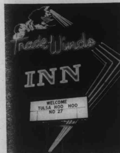
The old and new members of the Tulsa Hoo-Hoo Club couldn't miss this spot for the first meeting in many years.

All work and no play makes Jack a dull boy and the same goes for the hardworking (?) cats in Club #53. So, on the 12th of October, 75 of them journeyed to the number one club in Kitchener/Waterloo for the annual Oktoberfest celebrations—the culmination of two weeks for the largest beer and funfest in North America. The Concordia Club with its 4 oom-pah-pah bands entertained the nightly crowds of over 1000 celebrants as they raised their glasses in the traditional toast, Ein Prosit.