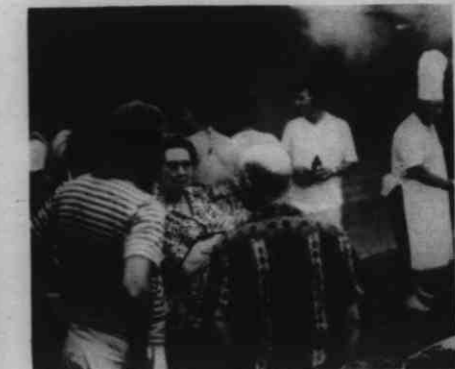
Here is a group converging around the aroma of barbecuing steaks.