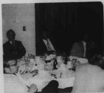
These people were not identified, but they seem to be very attentive.