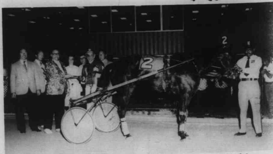
9th Race Buffalo Raceway, July 17 1973 ..... Trot 1 Mile: 2:08.3 "BUFFALO HOO - HOO CHAPTER #71"