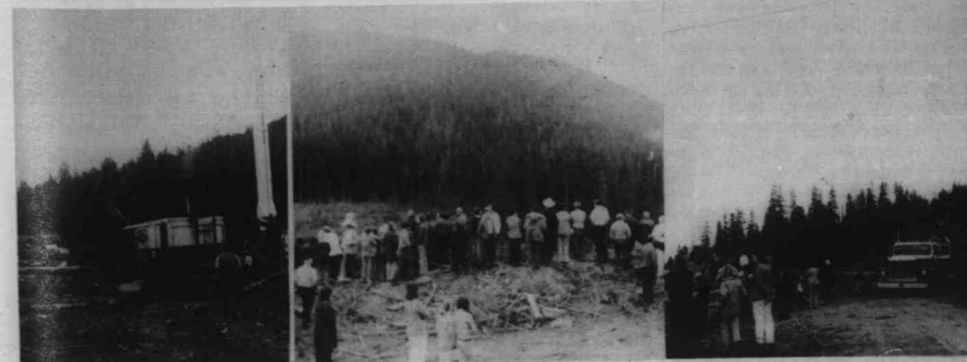
Heavy equipment loaded large logs while North Cascade group watched the loggers set chokers.