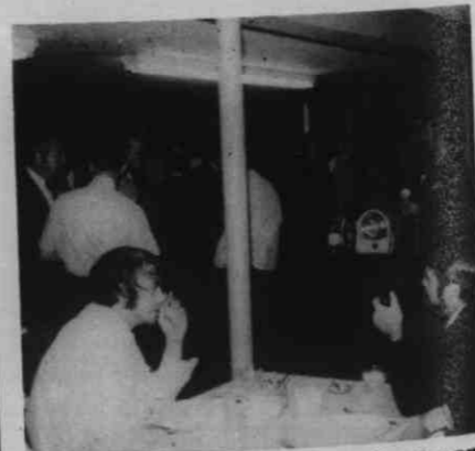
We call it the attitude adjustment period. Any takers?