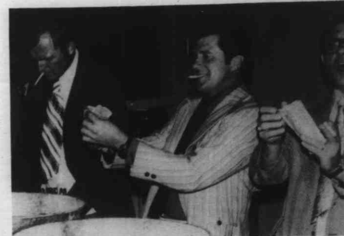
This station did not have a number, so we called it the Beer Station. The end of a very informative and educational day.