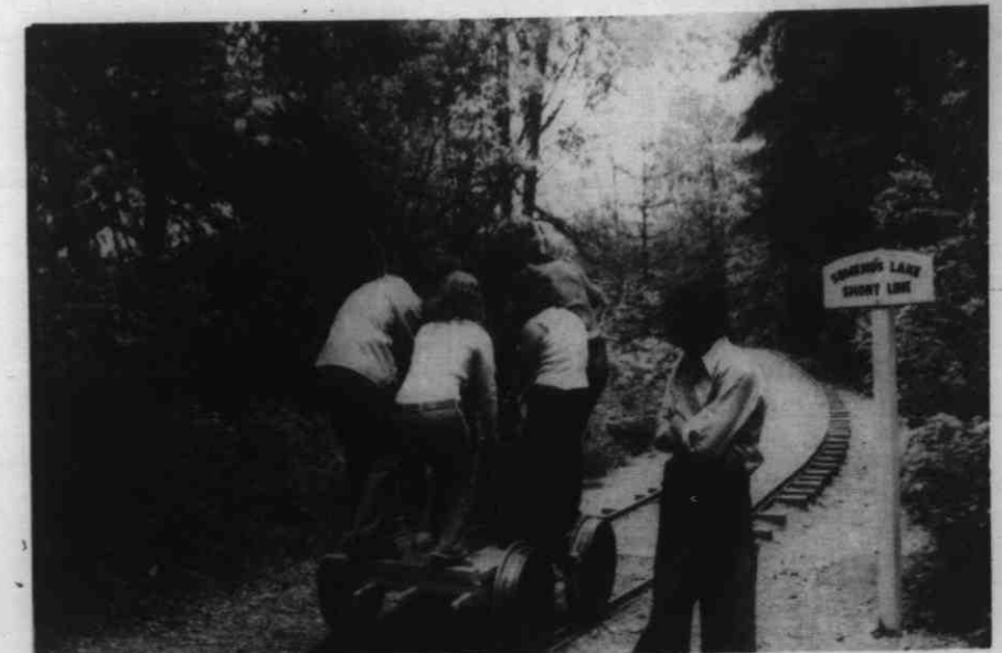
Here are some of the kids having fun at the Duncan Forest Museum. This was during the Victoria Club's 1973 Woodlands Tour.

Sioux Valley's next event is the annual Stage at the Izaak Walton Clubhouse on August 17th.