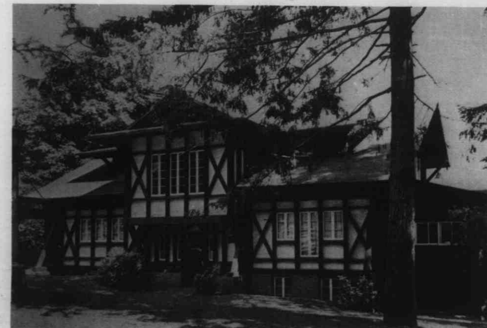
Here is a view of the exterior of the Hoo-Hoo House in Seattle, Washington in 1909. Building was demolished in 1959.