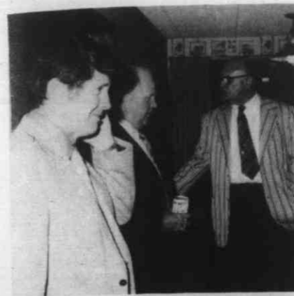
Club #6 members waiting in line for ?

There was either a golf prize or a door prize for almost everyone, so sum the whole thing up and everyone had a good time and I think everyone there is glad there is a Hoo-Hoo Club in St. Louis. I know I am!