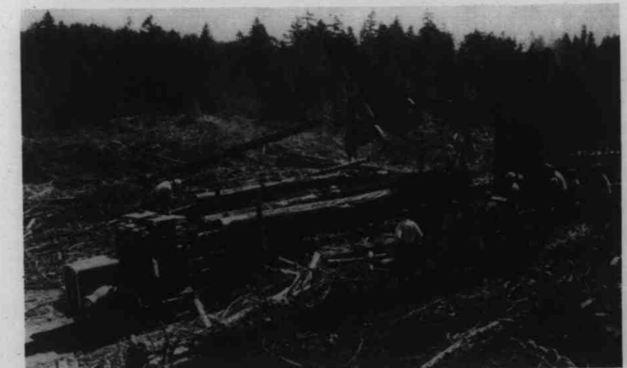
Here's a huge truck loading up for the trip from the forest to the mill.