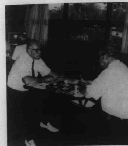
There is always a gin runny game or two.