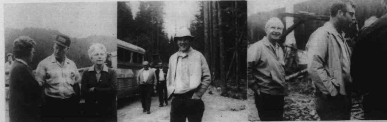
Some Hoo-Hoo members and their families observed logging operations. This is where it all begins for